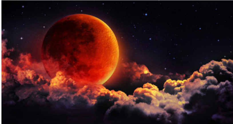
Blue blood super moon – next one due 31 st January 2037

Champagne corks (or rather, for budgetary reasons, corks of bottles of less expensive alternative sparkling wines) were popping at School Place on the last day of January to celebrate the announcement by Derek Mackay (Scottish Cabinet Secretary for Finance & the Constitution) that £5.5 million will be included in the Scottish Government's budget for 2018-19 to provide additional funding for Orkney's inter-island ferry service. It is a great relief that our message has at last got through to those who hold the purse strings. Furthermore, Orkney is set to receive an additional £1.1 million as its share of an increased allocation to local government. However, this budget is only for a single financial year. We still need a long-term solution for our ferry revenue funding and, of course, capital funding for a ferry-replacement programme. Therefore, we have to hope this financial settlement is not something that will happen only once in a blue blood super moon!