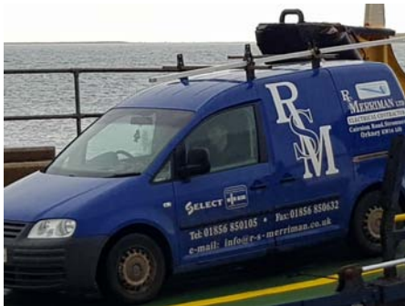
RS Merriman's vans arrive on Rousay

A special thanks to all of our project participants for your patience awaiting this long-anticipated project milestone.