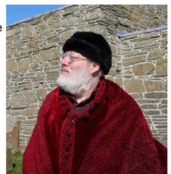
"Cloak" courtesy of Sanday Community School