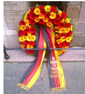
Wreath laid by the President of Germany

At a seminar I attended on rubbish recycling, feedback from Shapinsay and Westray on the alternate weekly collection was very positive, however, owing to Government Scotland's cuts to local authority funding, it looks like we are going to have to put its roll-out to the other isles on hold for the time being. At another seminar, we were told about an online budget simulator, with which, in due course, members of the Orkney public might be able to have their own stab at setting the Council's budget!