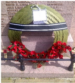
Wreath laid by the Princess Royal