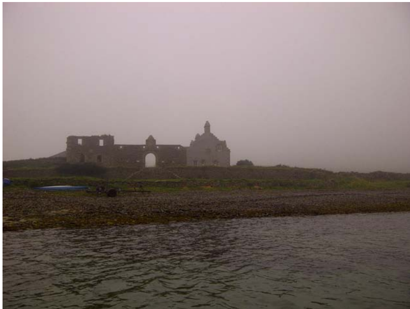
Arriving at Gairsay in the mist